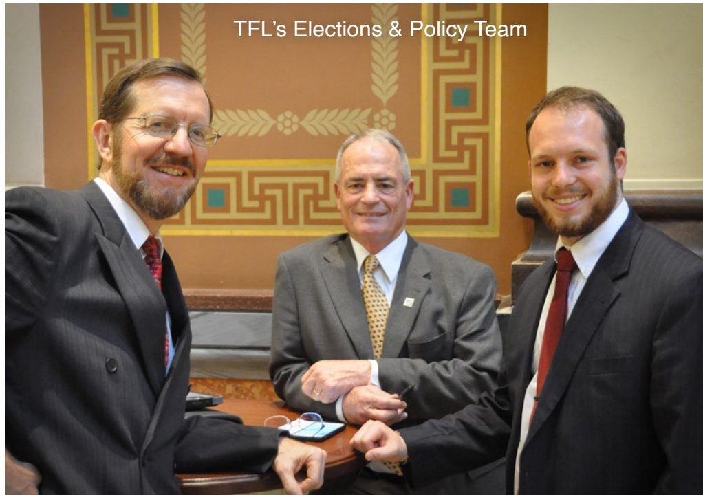
TFL's Elections & Policy Team

While our pastor partners speak grace and truth to government leaders' hearts, TFL's lobbying team speaks truth to policy. And 2019 was a banner year for legislative victories at the Capitol.