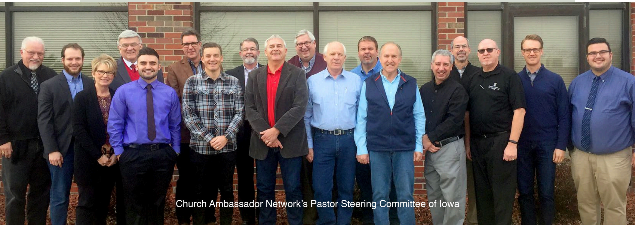
Church Ambassador Network's Pastor Steering Committee of Iowa

64,705 Downloads of the If 7:14 revival prayer app