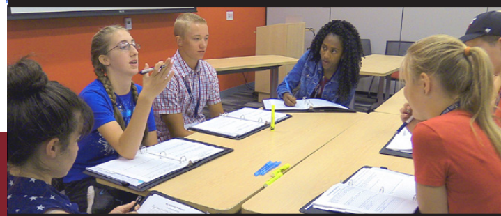
Class of 2018